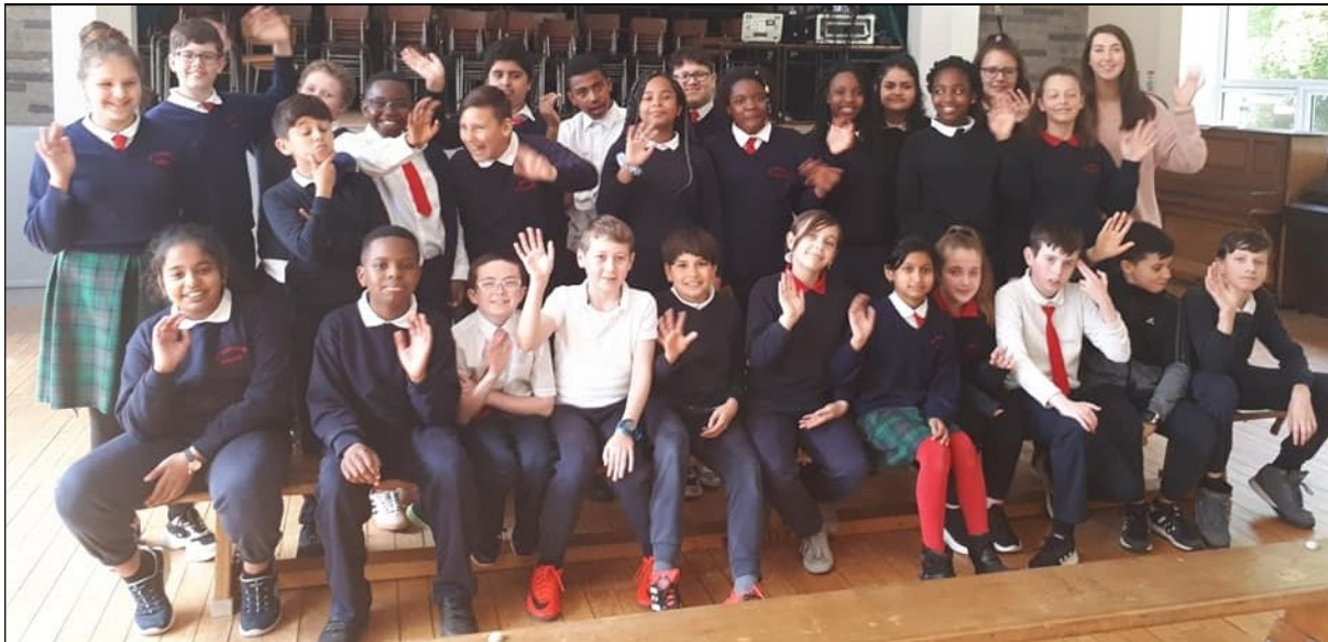
Group of Students in Lions & Leprechauns

The programmes were all broadcast throughout the area, to the delight of the children, parents and community.